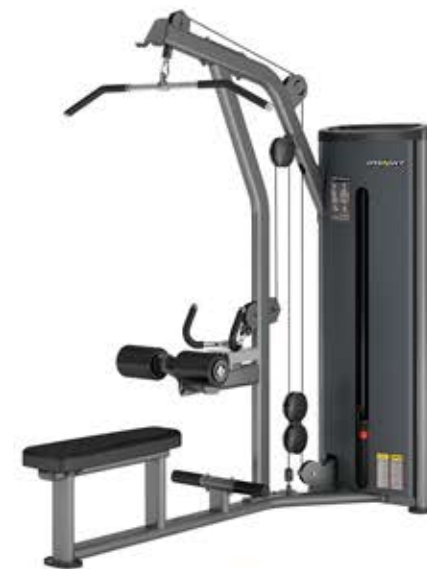
DA026E PULLDOWN/MID ROW