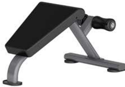
DR009 WEB BOARD