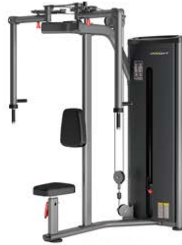
DA003E PEC FLY/REAR DELT