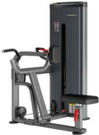
DA005E LOW ROW