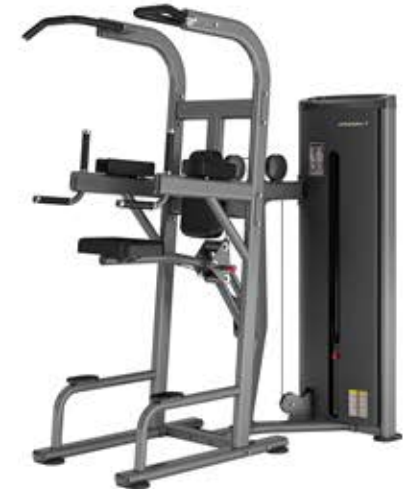
DA008E EASY CHIN/DIP