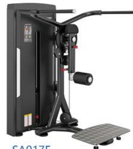
SA017E MULTI HIP