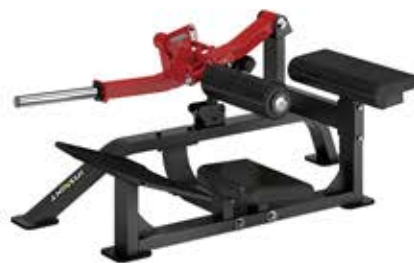
DH022B HIP THRUSTER