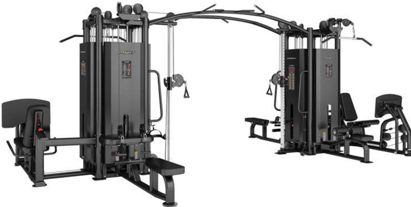
SA023+SA023+SA023OPT 8 STACK MULTI-STATION