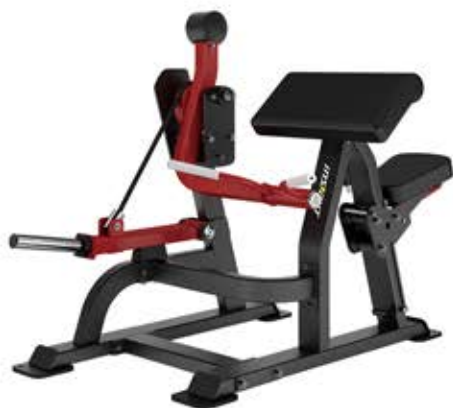
DH021 BICEPS CURL