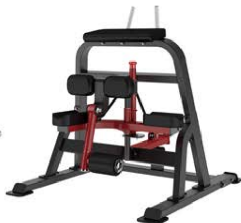
DH018 STANDING LEG CURL