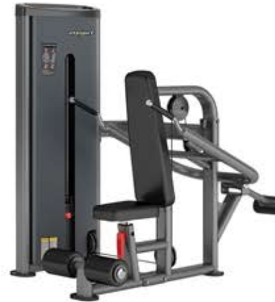
DA007E TRICEPS PRESS