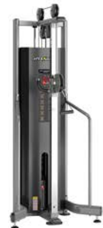
DA024 HI/LOW PULLEY