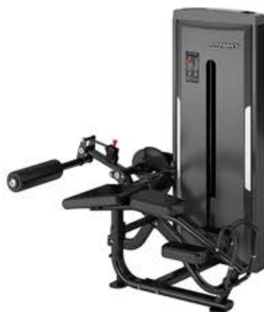
SA015E LEG CURL