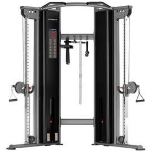
DA021 DUAL ADJUSTABLE PULLEY