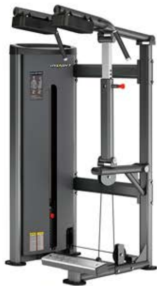
DA019D STANDING CALF EXTENSION