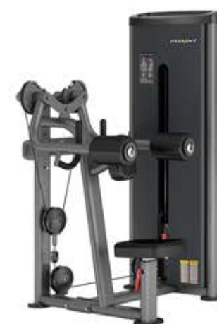
DA034E LATERAL RAISE