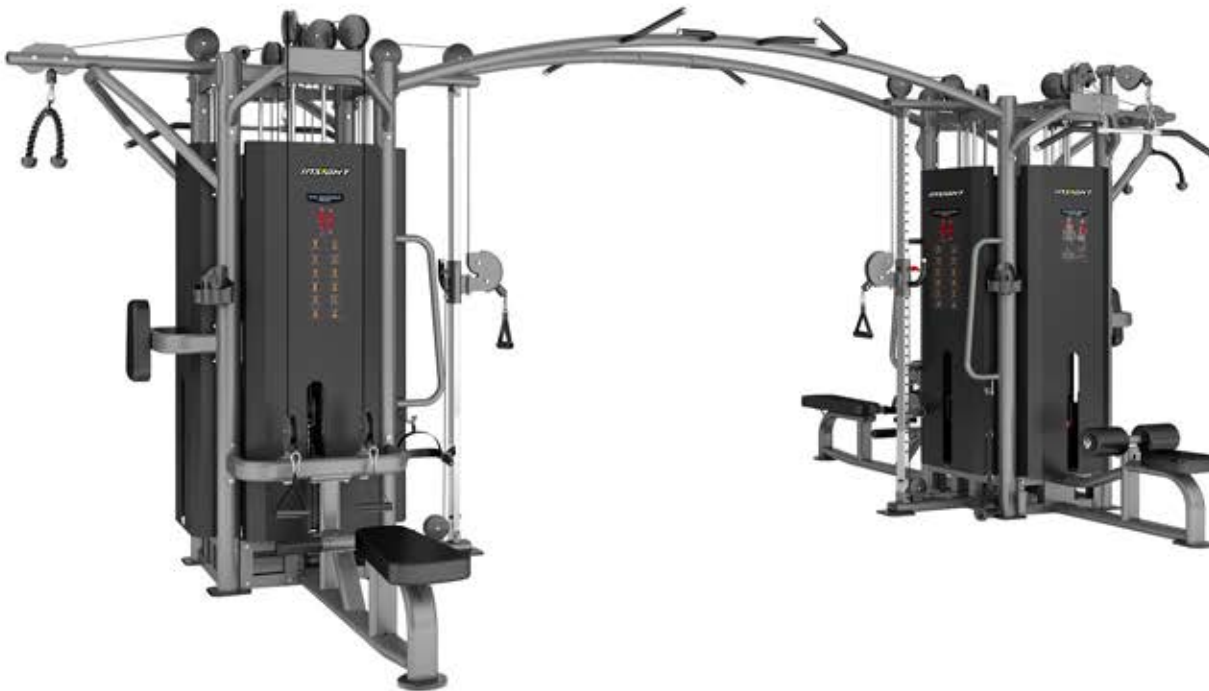
DA023+DA023+SA023OPT 8 STACK MULTI-STATION