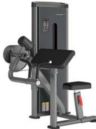
DA006E BICEPS CURL