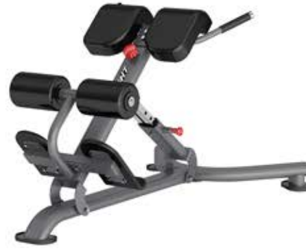
DR010B BACK EXTENSION