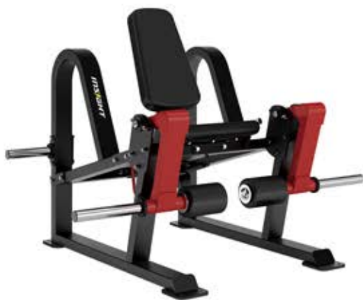
DH017 LEG EXTENSION