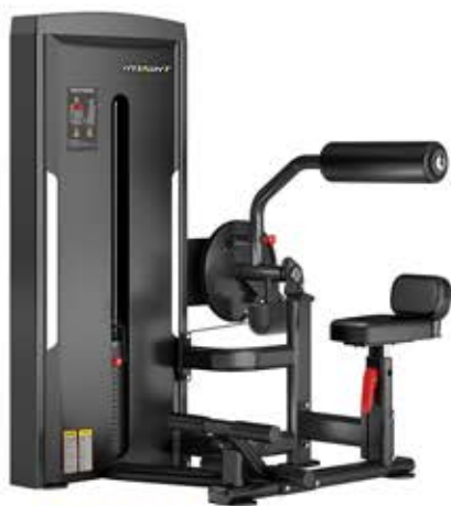
SA009D ABDOMINAL/BACK EXTENSION