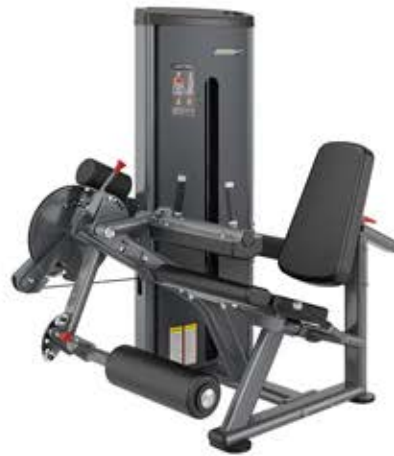
DA037E LEG CURL/EXTENSION