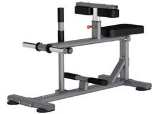
DR011 SEATED CALF RAISE