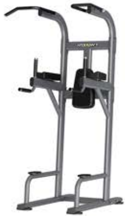
DR008B VERTICAL KNEE RAISE\DIP