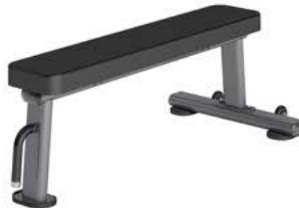
DR014B FLAT BENCH