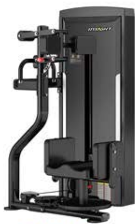
SA010D ROTARY TORSO