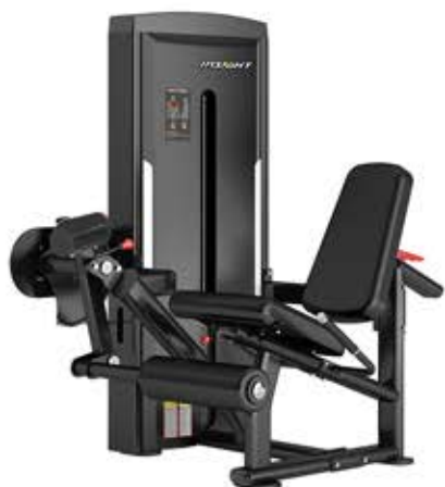
SA014F LEG EXTENSION