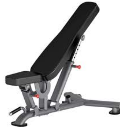
DR016B ADJUSTABLE BENCH