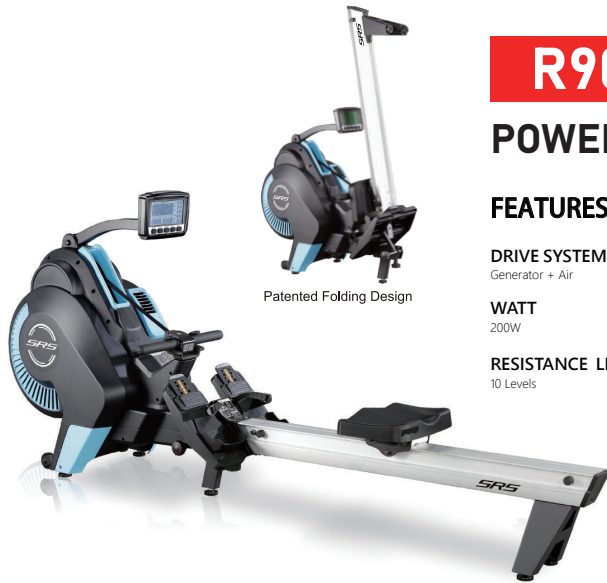
Patented Folding Design