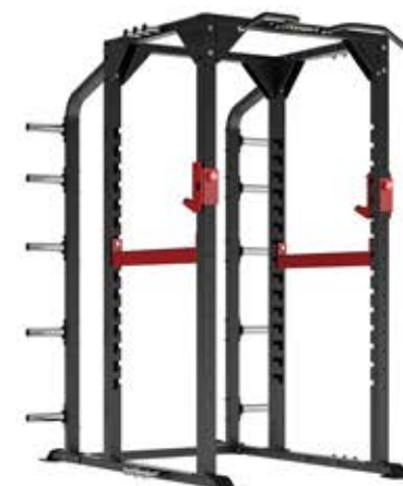
DH020 FULL POWER RACK