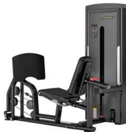
SA016D SEATED LEG PRESS