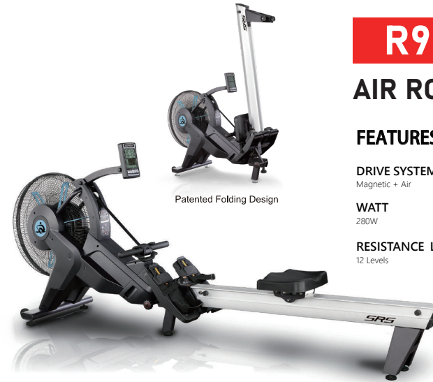
Patented Folding Design