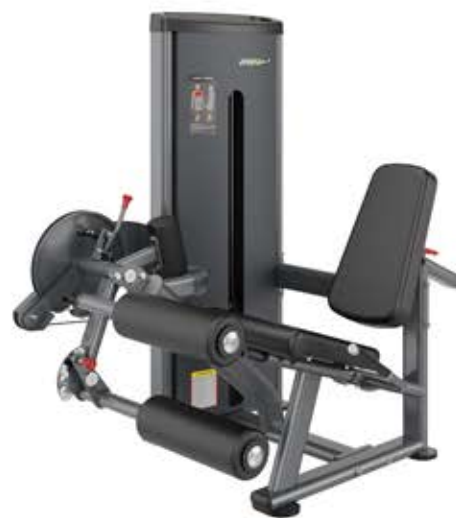
DA025E LEG CURL/EXTENSION