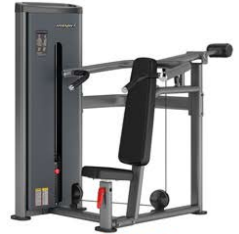
DA004E SHOULDER PRESS