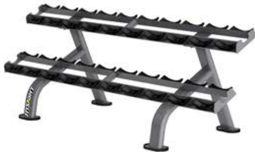
DR012 DUMBBELL RACK