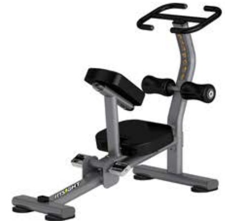
DR018 STRETCH MACHINE