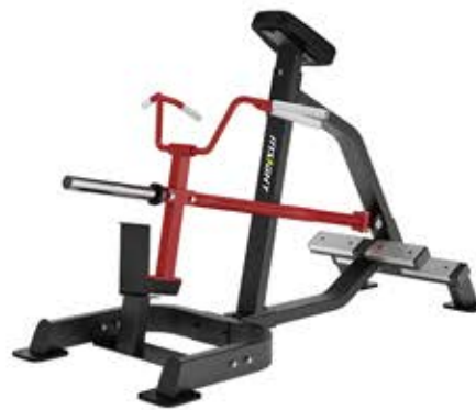
DH023 INCLINE ROW