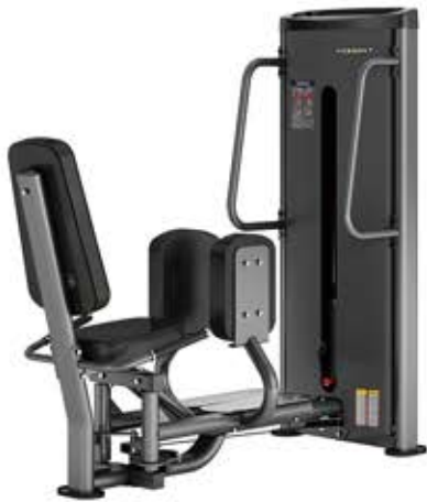
DA036D STAND/SEAT ABDUCTION