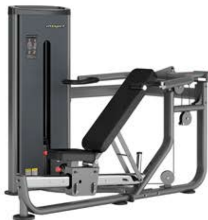
DA029E MULTI PRESS