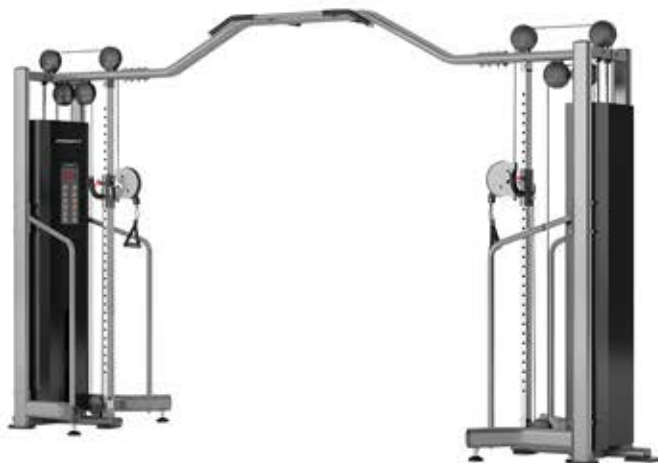
DA022 CROSSOVER CABLES