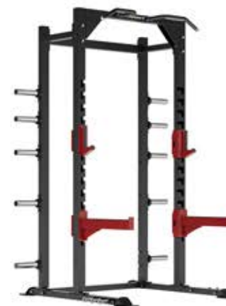
DH024 HALF RACK