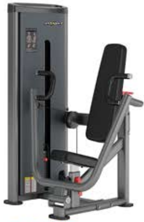
DA001E CHEST PRESS