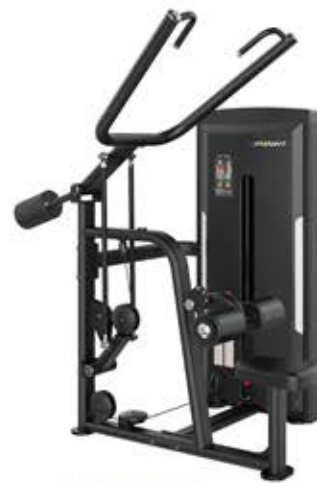
SA011E LAT PULLDOWN